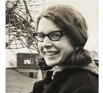
Jocelyn Bell Burnell